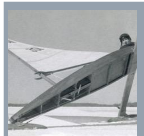
We posted this shot of JoAnn Callahan in a DN ice boat on our Facebook page. You might wonder why she isn't hiking out. Or can you even do that on a DN?